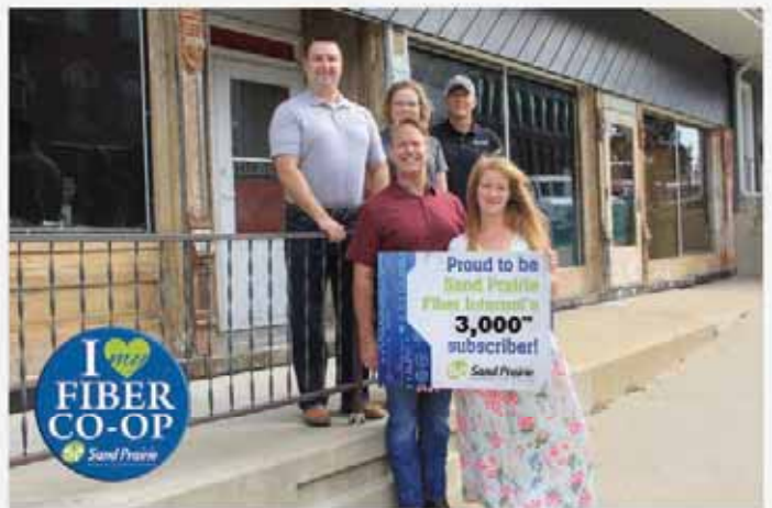
Pictured from left to right in front row:

We have remarkable crews that are working day after day to bring fiber to our members. THANK YOU to the line crews, engineers, installers, operations personnel, and broadband technicians here at Sand Prairie. We are proud to serve as your local fiber co-op!