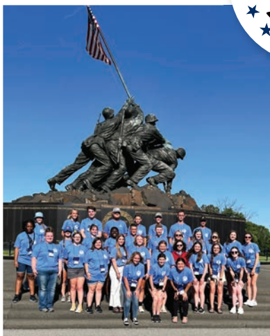
Youth Tour students in front of the Iwo Jima Memorial in Arlington, Va.