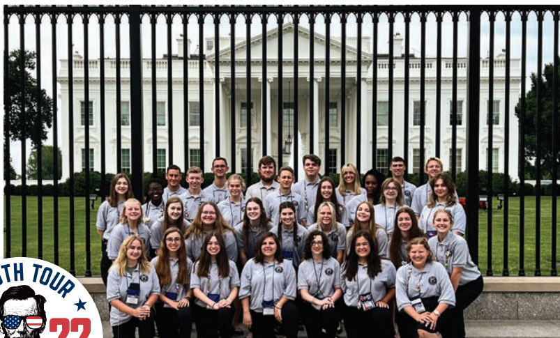
The 2022 Youth Tour students in front of the White House, Washington, D.C.