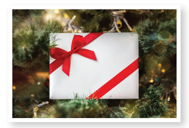
18F Gift of energy Give creatively this season